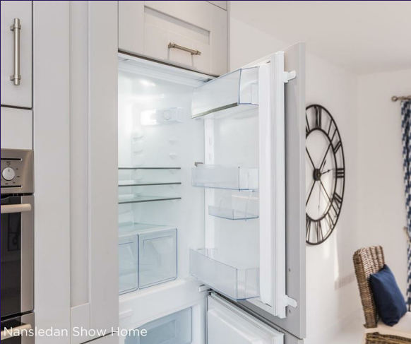
Nansledan Show Home