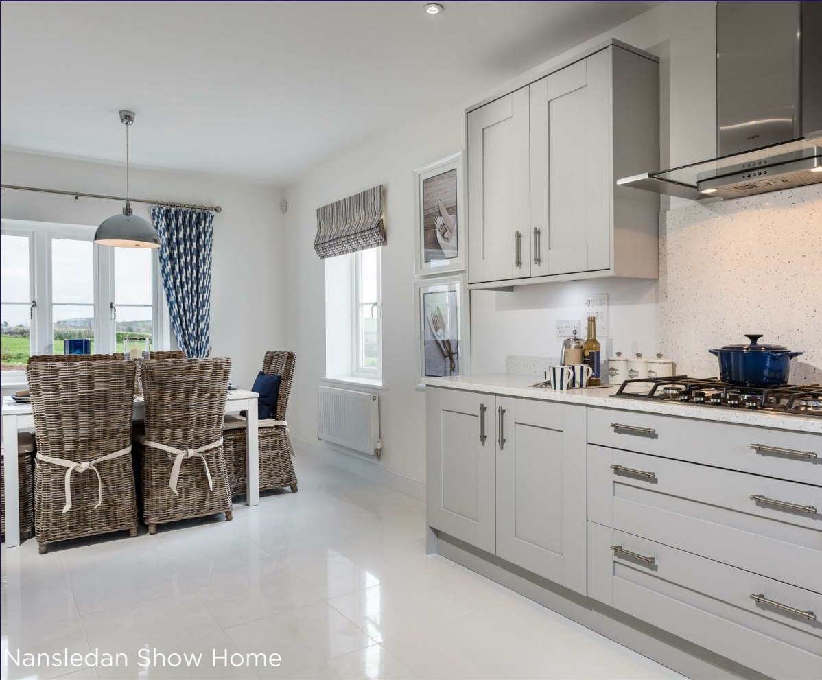
Nansledan Show Home

Over time Nansledan will evolve into a community of more than 4,000 homes supporting a similar number of jobs. It will include its own High Street, church, school and public spaces, helping to meet the future needs of Newquay in a complementary and sustainable way.