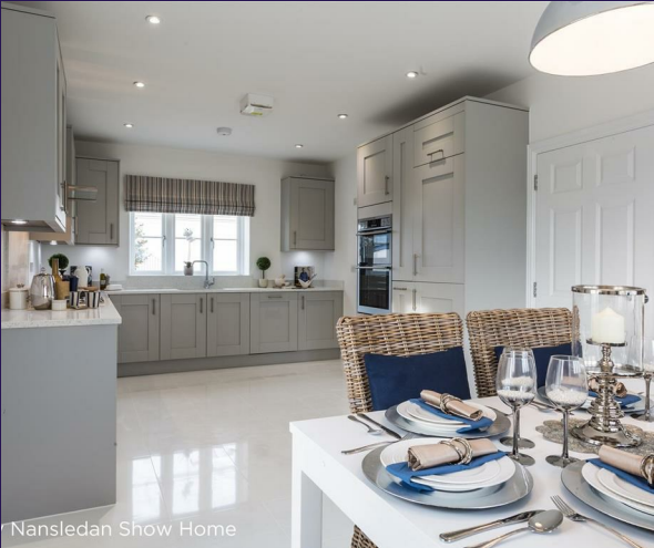
Nansledan Show Home